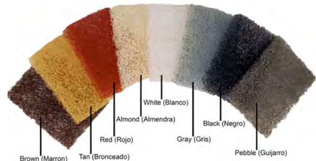
Available in 8 Colors

WeepVent™ is most effective when installed in combination with MortarNet™, HouseNet™, LathNet™ or WallNet®.