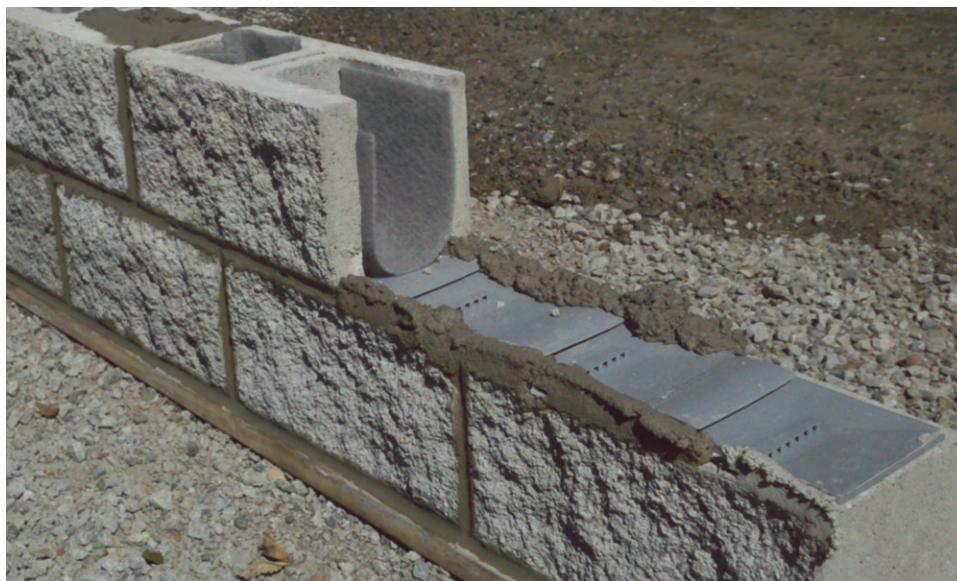
Shown is Mortar Net's Blok-Flash product.